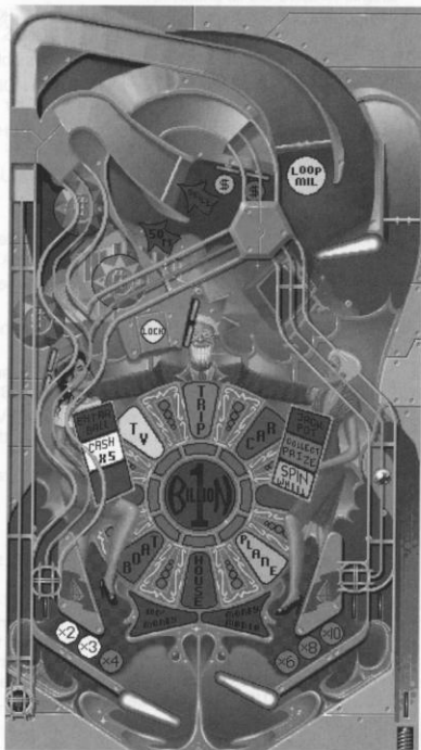
TABLE 3 • BILLION DOLLAR GAMESHOW